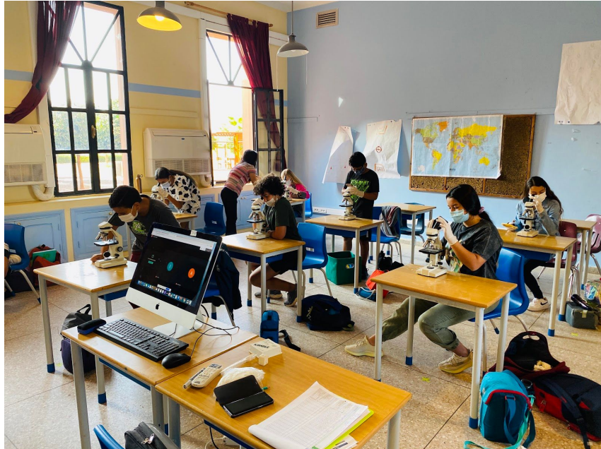
Grade 11/12 Physics...