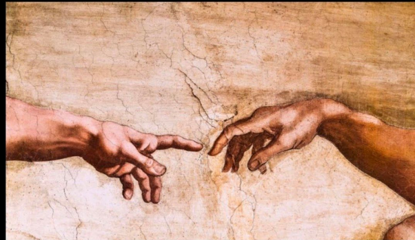
THE CREATION OF ADAM