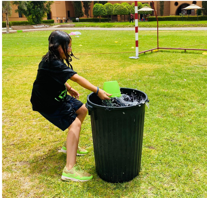
Photo Memories Upper School Sports Day Activities...